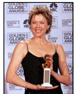
Above: Annette Bening, winning a Golden Globe for The Kids Are All Right

At press time, the gay themed Kids Are All Right was up for Best Picture, Best Actress and Best Supporting Actor at the Academy Awards on February 27 th . Kids tells the story of two female partners, who each have a child by the same anonymous sperm donor. 18 year old Joni, played by Mia Wasikowska ( Alice In Wonderland ) looks up the birth father one day, at the urging of her younger brother Laser, played by Josh Hutcherson ( Bridge To Tarabithia .) The father turns out to be a college drop out named Paul, played by Mark Ruffalo (nominated for an Oscar) who immediately clashes with Annette Benning’s character Nic, a tightly wound doctor, who drinks too much. Paul has more in common with Jules, played by Julianne Moore, who is the only one of the three parents who did not receive an Oscar nod. Jules drifts from job to job, and has a hard time sticking with things. I can’t reveal much more, but it’s immediately clear that the adults in this movie have issues to work out. As the title says, however, the kids are, well, all right. It’s an unconventional family that any straight family can relate to. The family conflicts are no different for this clan than for most families that are lead by heterosexuals. I highly recommend it.