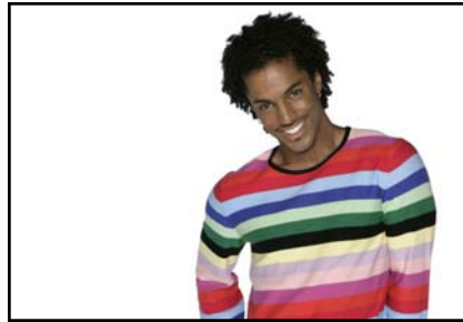
Top: Tracy Chapman, Bottom: Noah's Arc star Darryl Stephens