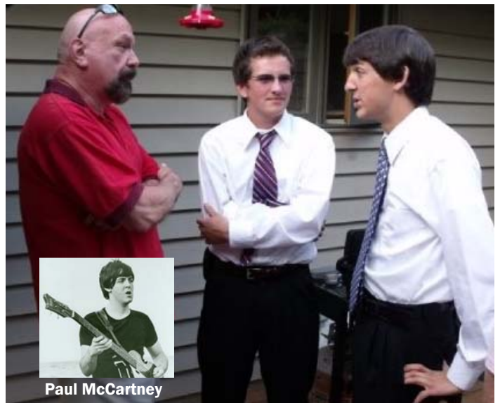
Right: some fans speaking with Paul McCartney. Wait! Doesn't he ever age!! That can't really be him . . . Can it?