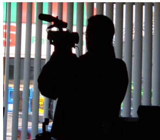
Above: Grand Rapids, MI