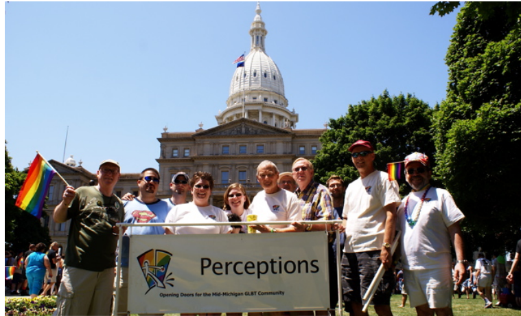
Lansing Pride March 2007

For many years, I thought of joining Perceptions, but saw it as a kind of social club. I certainly didn't take it seriously as an agent of change. This past summer when I was asked to fill a vacancy on the board, I began to really examine this organization. Who are you? What are you all about? What is your true purpose? I read your mission statement: