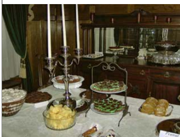
2007 Chocolate Party