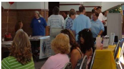
Respect Fest 2007

I thought of my own story and how I got here to this place and to this point in time. Have so many years passed by? On some days the pain I experienced during my pre-transition years is a distant memory and other days it is very fresh and very real. Ultimately it was the love of family that got me through.