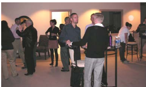
Wine Tasting Event

ways you can share yourself with the community. Maybe you have some ideas of your own that you can share with us.