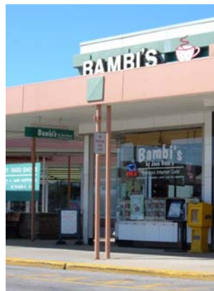
Meet & Greets

to convey to you the importance of family. I wanted you to know that in the end, family will get you through. If you have no other family out there, know that you have one here. Like all families, we may not always agree and sometimes may experience hurt feelings, More often than not, what we experience is a connection with people who know and understand us and accept us as we are. This is the power of family and with family comes responsibility. Who is