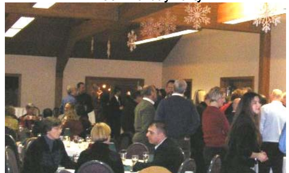
2007 Holiday Party

I also hope you take time in the New Year to share your Perceptions with others.