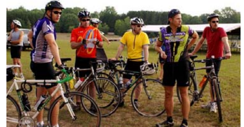
Camp Out Michigan Bike Tour 2007

Our biggest fundraiser of the year is in the form of a holiday party, but it is still first and foremost